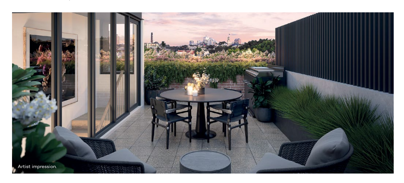
^ The Rathbone, Surry Hills

We see great opportunity in the Australian residential housing market and look forward to creating exceptional communities for this generation and those to come.