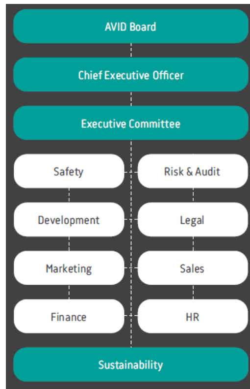
Graphic 1: AVID's Corporate Governance Structure

Our key policies relevant to modern slavery are:-