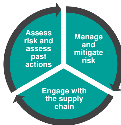
Graphic 2: Modern Slavery Compliance Cycle