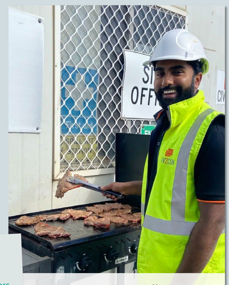
Hard Hat Day Fundraising Efforts

Events were held in conjunction with on-site civil contractors Rokon Pty Ltd and Civ2Con, who eagerly offered their support, with funds allocated towards completing two Haven Home projects.