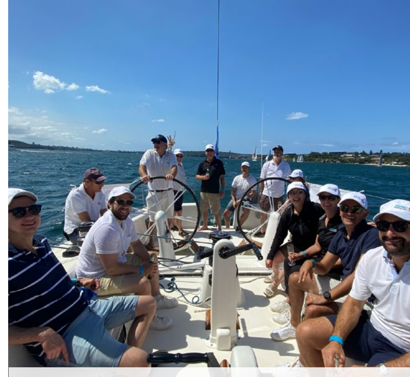
Members of the Sydney team take part in the Sydney Property Industry Foundation Regatta

The Foundation's initiatives serve as a blueprint for our industry, illustrating the impact that can be achieved when we unite for a common cause. Leading by example, the Foundation is not only contributing to tangible solutions for youth homelessness, but also inspiring a shift towards more socially responsible business practices within the property and building sector.