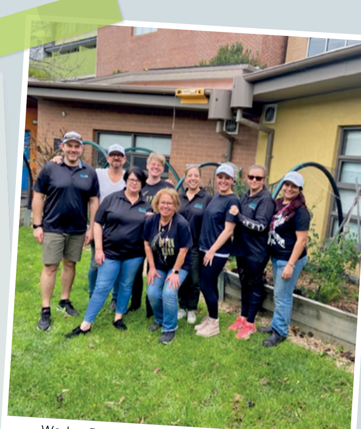
Worker Bee to support the Salvation Army Youth Crisis Refuge