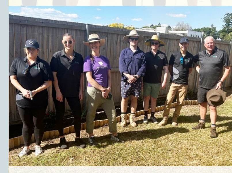
QLD Worker Bee