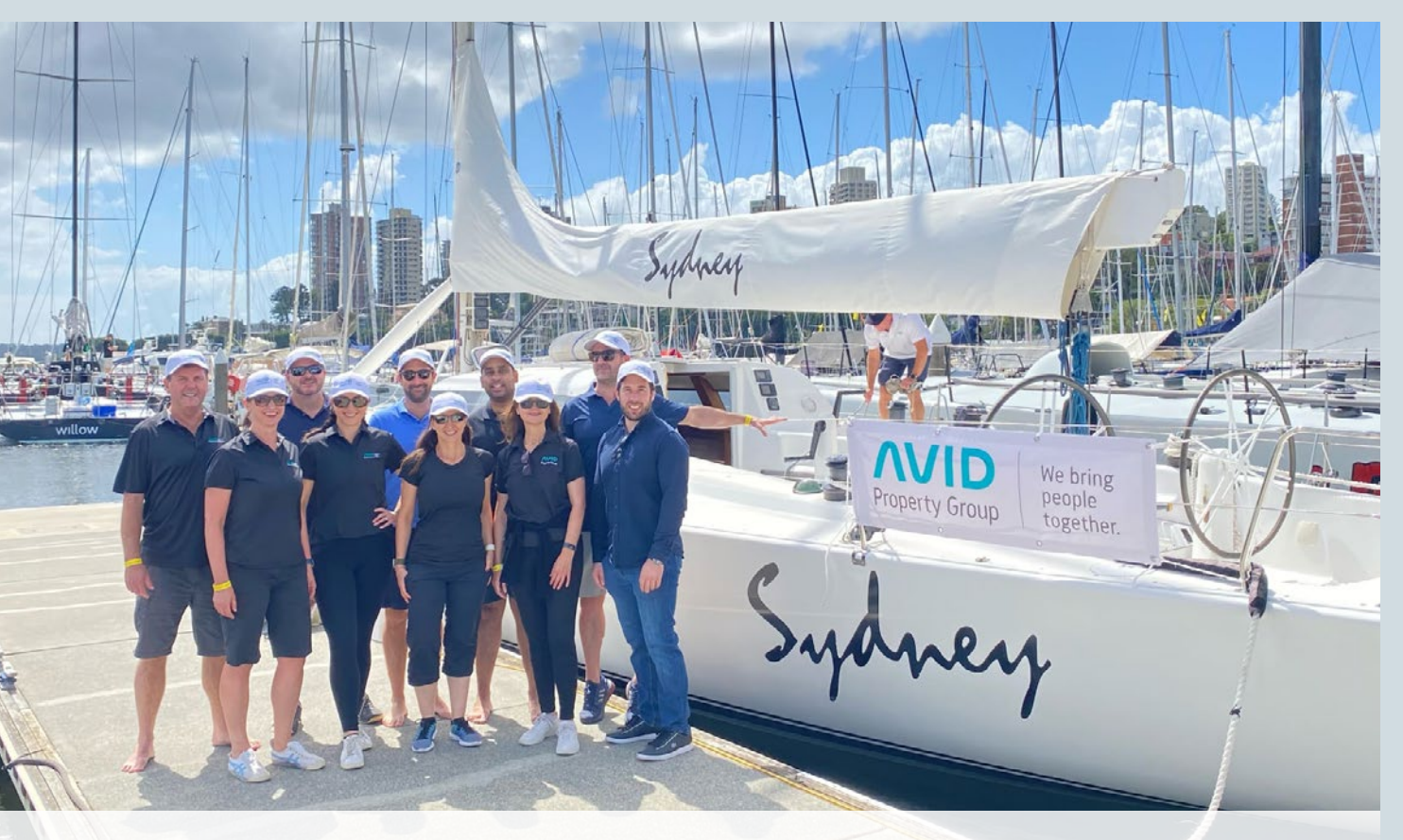
Sydney PIF Regatta